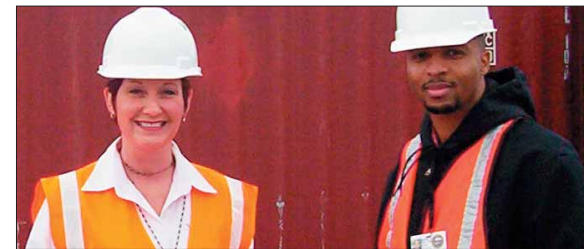
Deployed, unknown location, with a work associate.