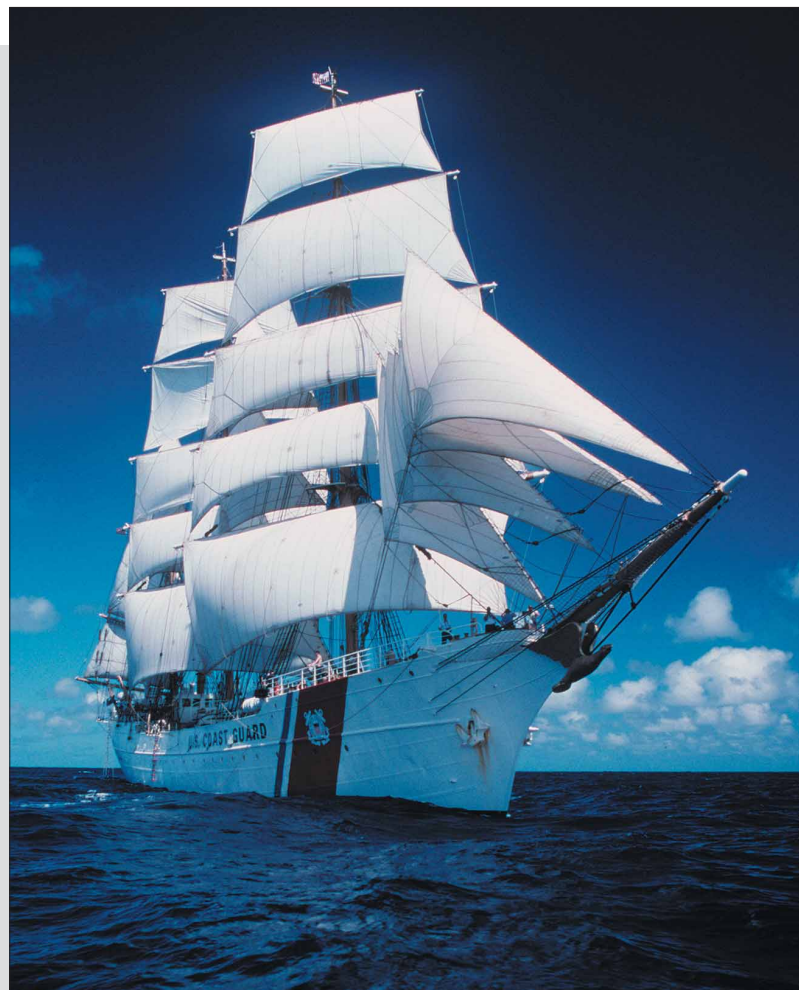
Coast Guard Cutter Eagle under full sail off the coast of Puerto Rico.

Participating with multi mission character and capabilities, as well as unique abilities in port, coastal and environmental security, the U.S. Coast Guard has served in numerous roles during Operation Iraqi Freedom. The Coast Guard has a tremendous responsibility in support of the military in its ongoing fight against terrorism.