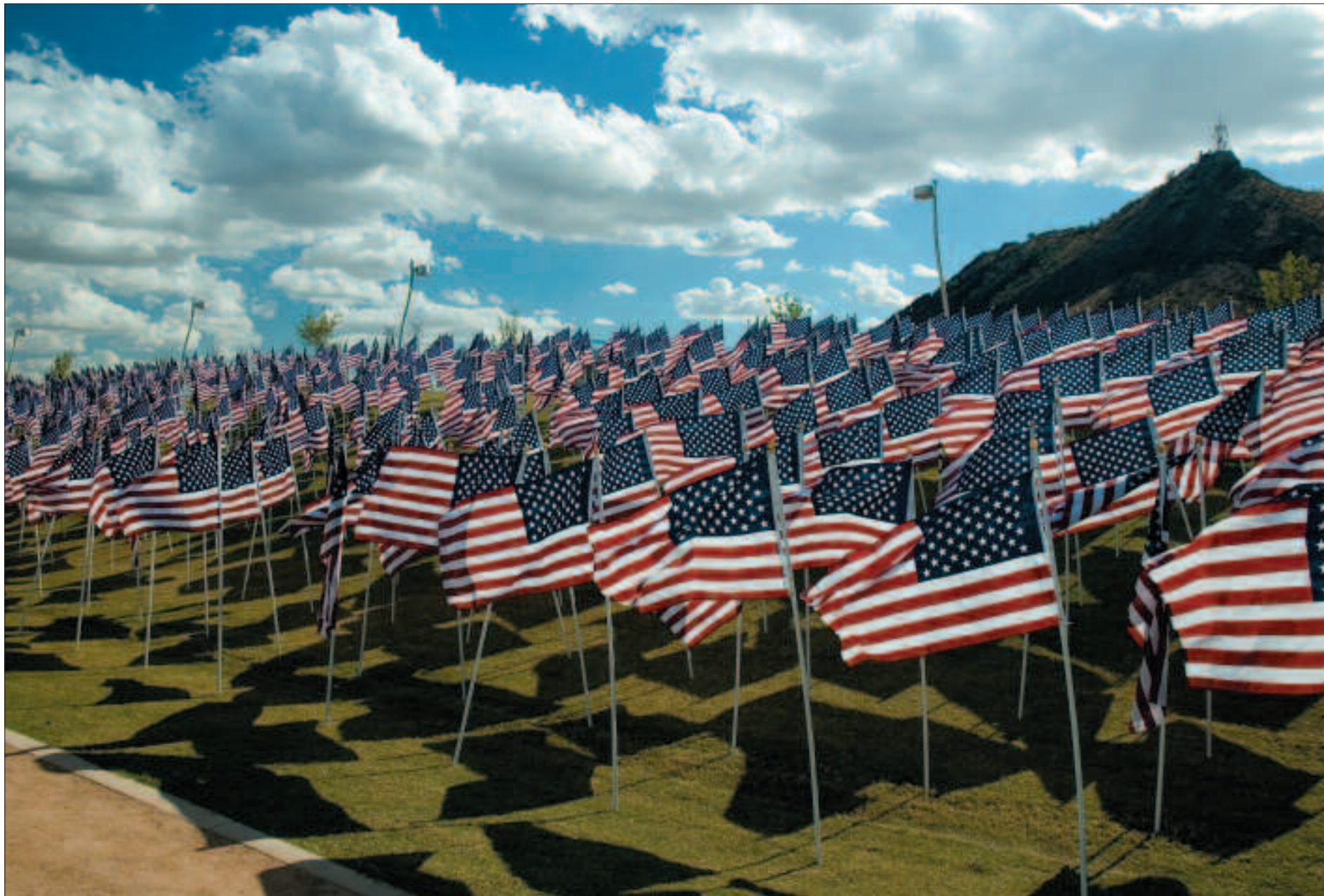
Flags caught in a gust of wind fly proudly at Tempe Town Lake.