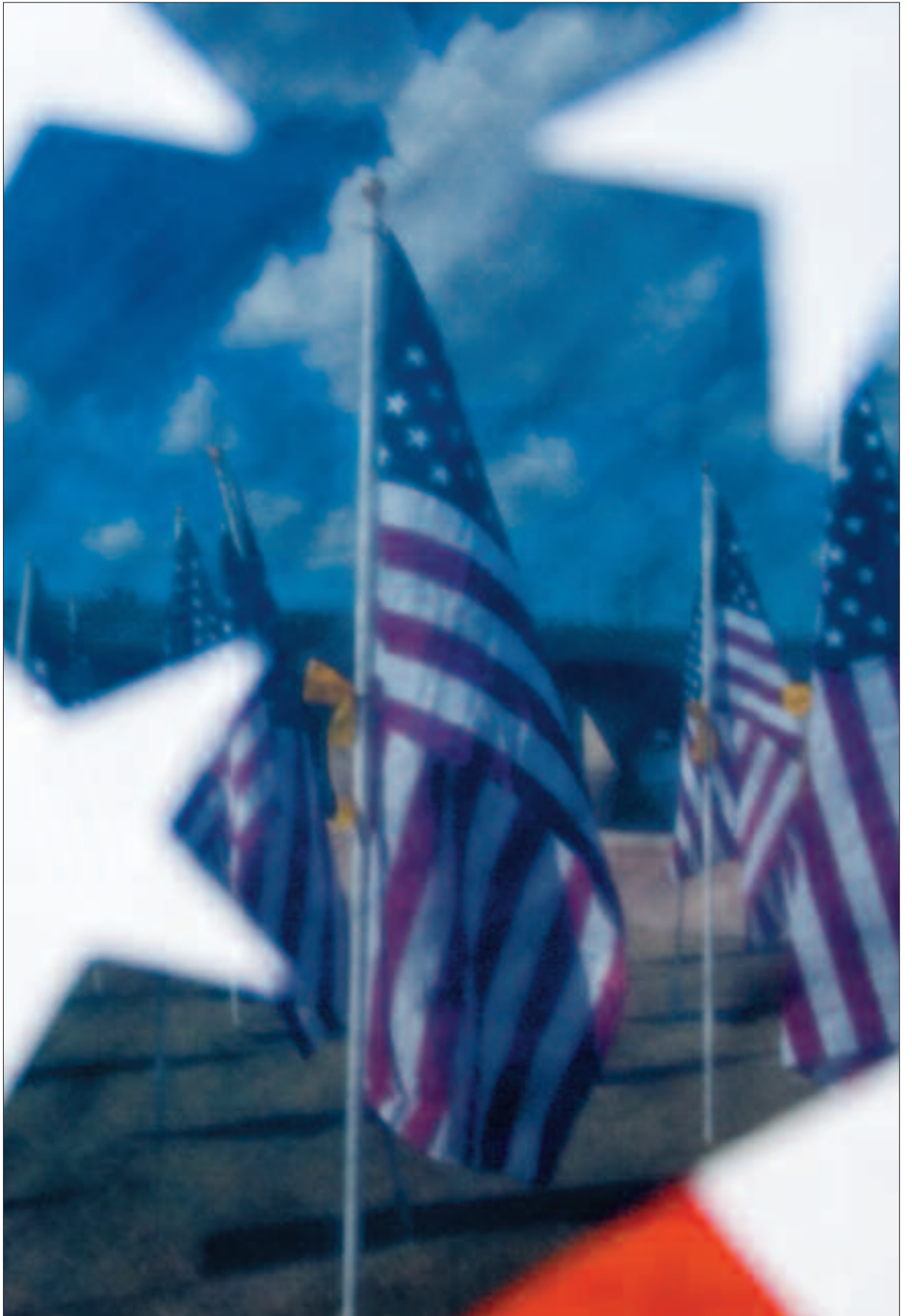
Through the stars at Tempe Town Lake on Veterans Day.

Military Veterans can find more information on scholarships, job opportunities, transitioning, and resume and interviewing tips at www.military.com .