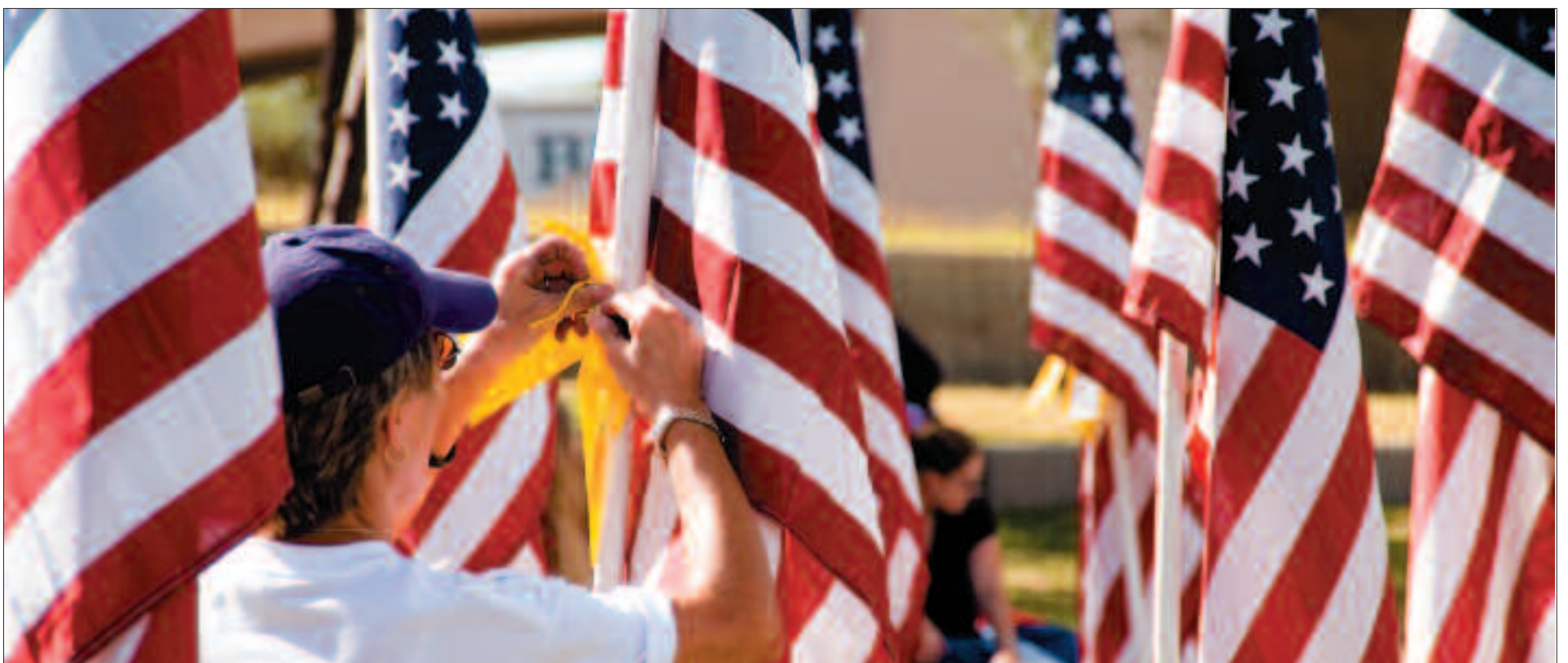
A volunteer attaches a ribbon with the name of fallen soldier of the war in Afghanistan and Iraq.