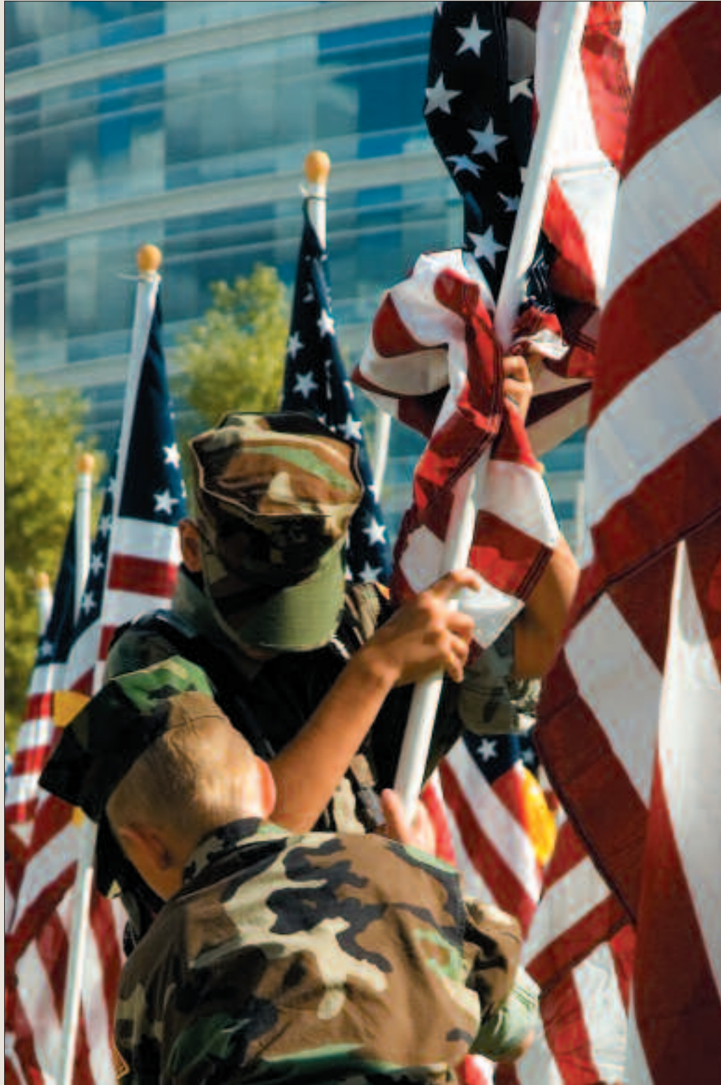
Young Marines of Mesa fix a fallen flag on Veterans Day.