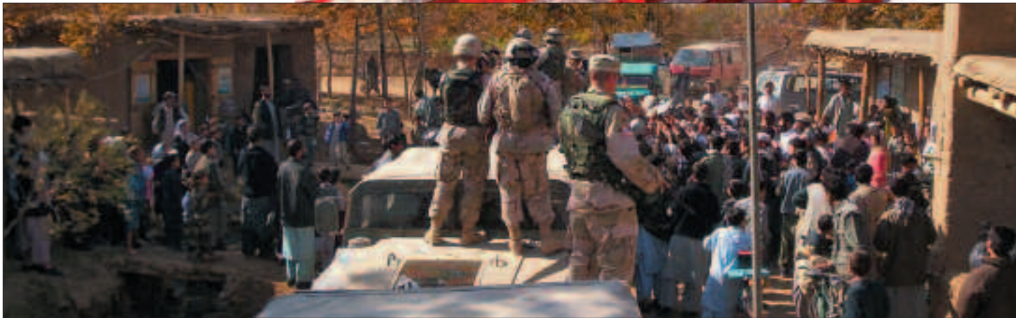
As part of Humanitarian Civic Assistance (HCA), soldiers distribute clothing to the village of Qal'a Beland. This is in preparation for the upcoming winter. Most supplies come from donations.