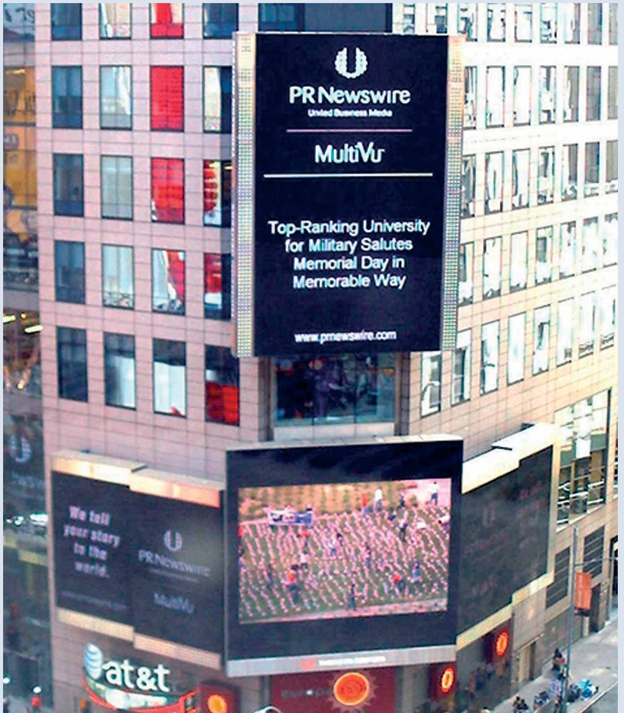
Video from University of Phoenix Memorial Day events were shown in Times Square.

Additionally, University of Phoenix has teamed up with AT&T and Cell Phones for Soldiers. Employees, students, faculty and staff are invited to visit their local campus and donate their used cell phones or wireless devices to drop box locations at campuses and locations company-wide. The cell phones are then turned in to the organization and calling cards are sent to the troops overseas. This will be an ongoing program.